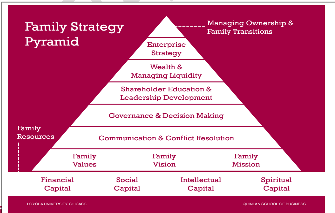
Figure IV-V.2. Family Strategy Pyramid To learn more about the above elements, see the companion documents ( Managing Relationships, Governance, Leadership and Managing Transitions and Family Business Continuity ) or visit the Family Business Stewardship Institute online .